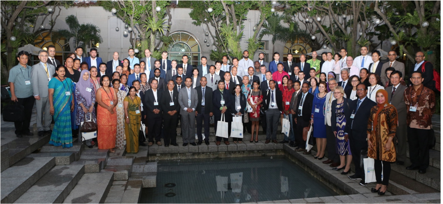
Group Photo of the participants of inaugural conference of the Asia Pacific Public Electronic Procurement Network from 5-6 October, 2015 at ADB Headquarters, Manila, Philippines