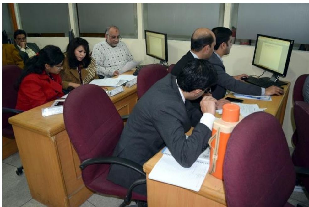
Participants interacting with each other during the practical exercises / case study based on the legal framework of PPRA