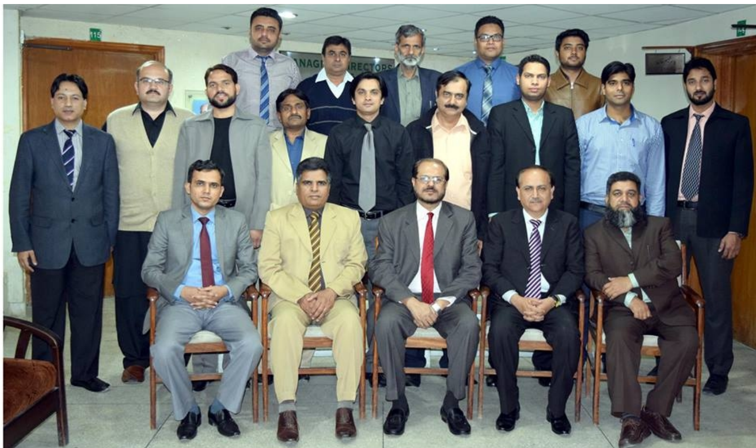
Group Photo of Capacity Building Training Programme on Public Procurement Rules and Procedures 16th - 17th March, 2016

During the 1st quarter, NIP conducted 02 training programmes and imparted training to 34 officers and officials of the public sector. The participants belonged to Zarai Taraqiati Bank Limited (ZTBL), Pakistan Agriculture Research Council (PARC), Pakistan National Shipping Corporation (PNSC), Govt. College University Faisalabad, OGDCL, TRYCO, Central Power Purchasing Company, Teller Communications, Islamabad High Court, Prime Minister's Office (Public), Aiwan-e-Sadr, APF Kamra, PIA, Trillium Information Security Systems (TISS), TESCO, Gilgit Baltistan PWD, M/o Commerce, TGS Corporation and NADRA.