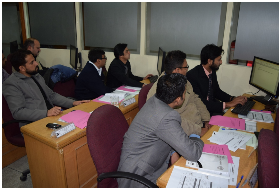
Participants interacting with each other during the practical exercises / case study based on the Legal framework of PPRA