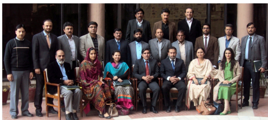
Group Photo of the participants of the training program held on 12-13 Feb, 2014