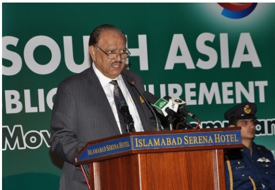
President of Islamic Republic of Pakistan Mr. Mamnoon Hussain addressing the inaugural session of Second South Asia Regional Public Procurement Conference, 25th March, 2014

"One of the key objectives of this Conference is to explore ways and means of initiating regional cooperation on public procurement, I would suggest SAARC Secretariat to consider taking lead role in promoting mutual cooperation and opening SAARC public procurement office in Islamabad. Pakistan will warmly welcome such an initiative."