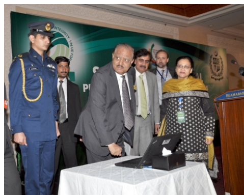
President Islamic Republic of Pakistan, Mr. Mamnoon Hussain launching MOOC on Public Procurement

Professional Diploma in Public Procurement.