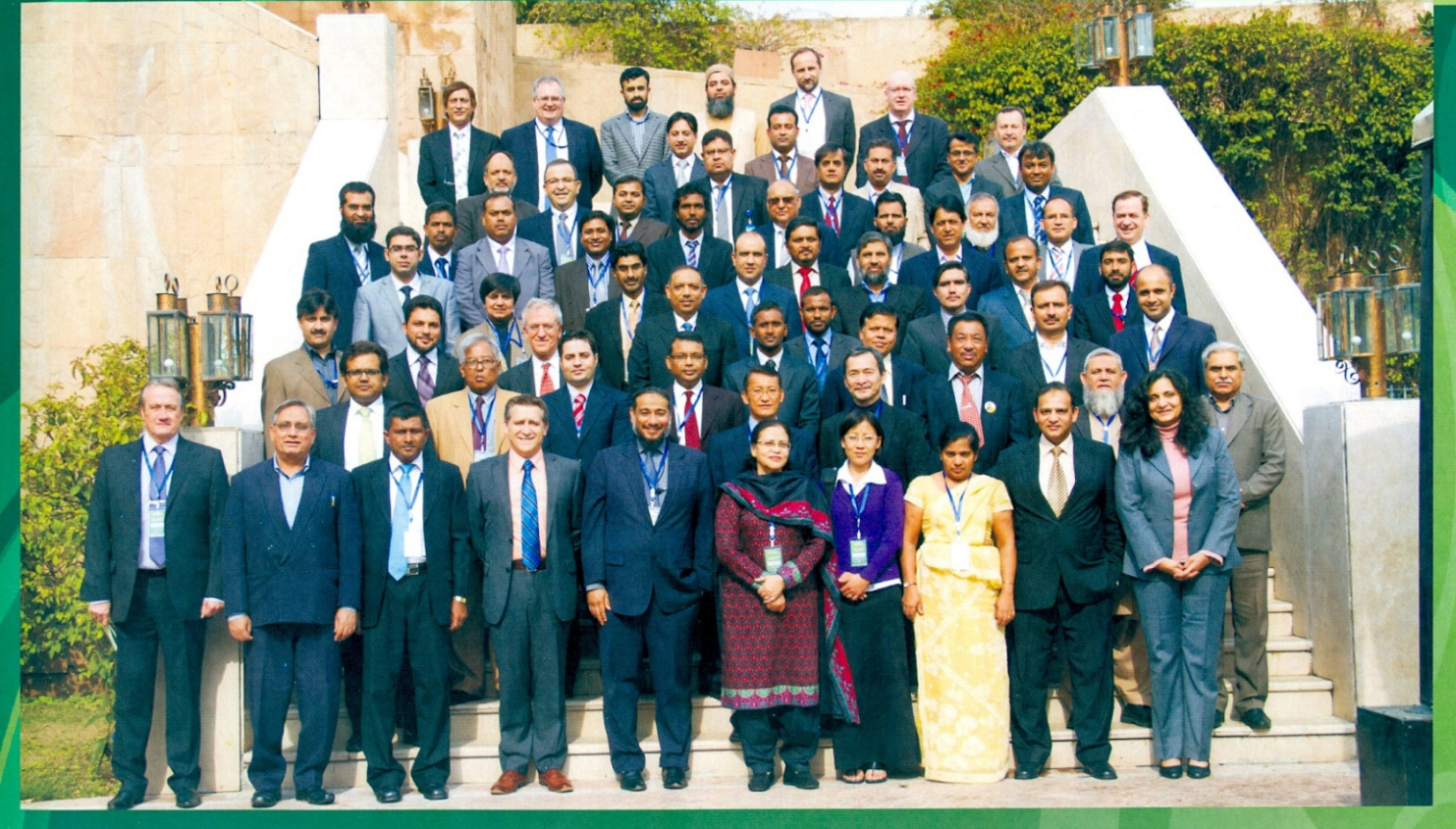
Group Photo of the participants of Second South Asia Regional Public Procurement Conference 25-27 March, 2014