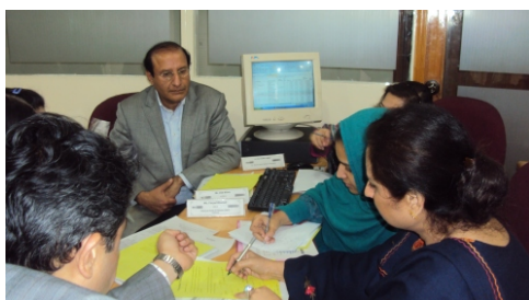
Participants interacting with each other during the practical exercises / case study based on the legal framework of PPRA.