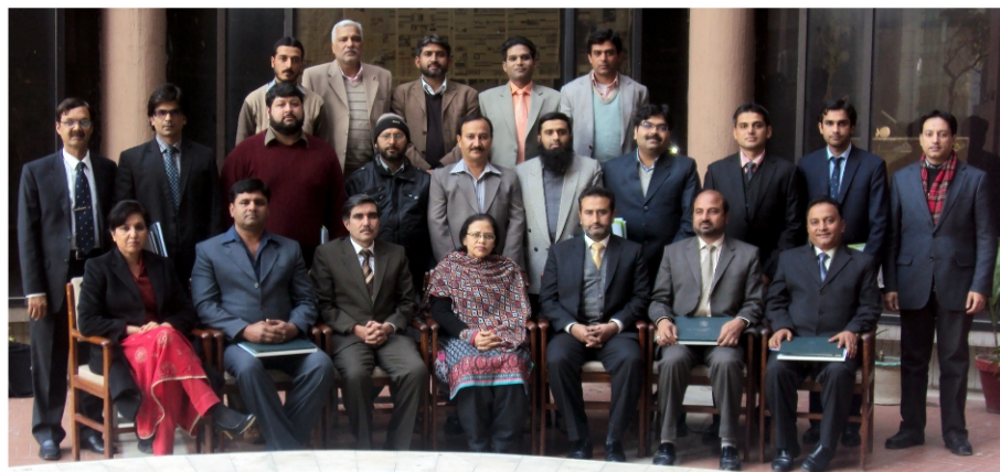
Group Photo of the participants of the training program held on 01-02 Jan, 2014

During the period from January to March, 2014, PPRA trained a total of 36 participants by arranging two capacity building programmes. Participants mostly belonged to Oil and Gas Development Company Islamabad, Bahria University, Islamabad, Pakistan National Shipping Corporation (PNSC) Karachi, University of Engineering & Technology, Taxila, Zarai Taraqati Bank (ZTBL), Islamabad, and 118 Electrical and Mechanical Battalion, Mangla Cantonment.