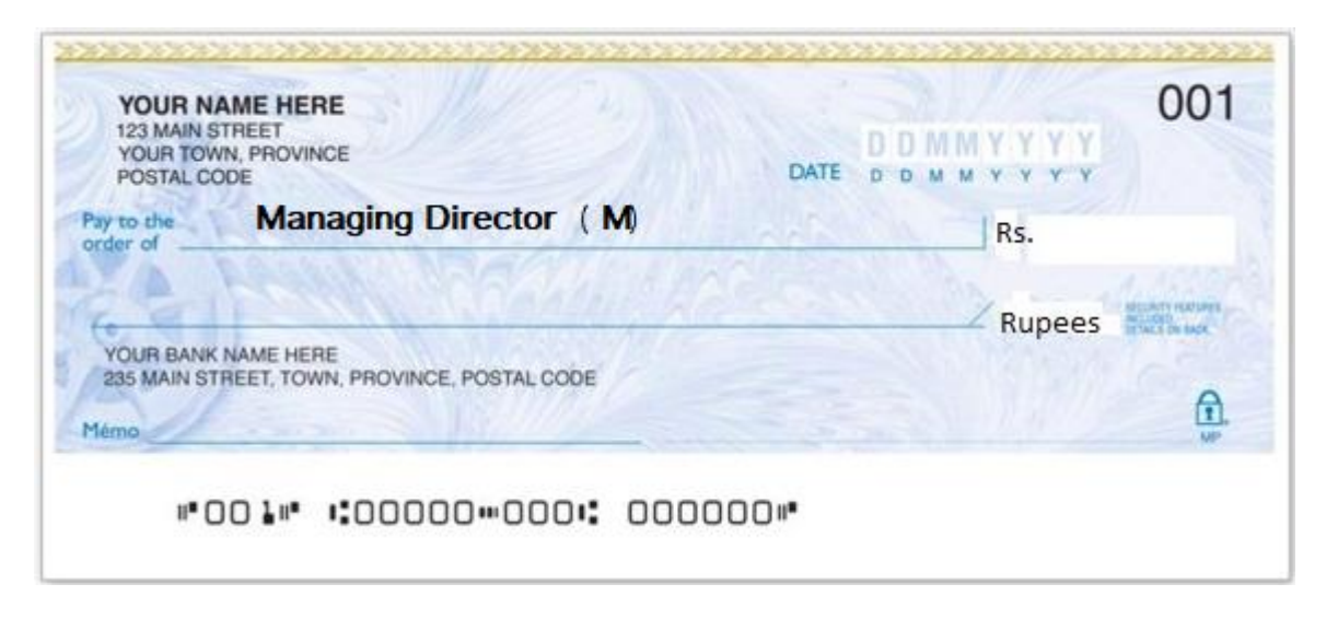
OR (As per Sample of CDR)